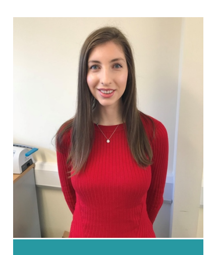
"I feel very proud when I see a product that we have developed, displayed on the shelves in supermarkets."